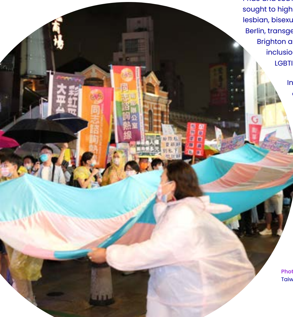
Photo: Taiwan Trans March 28 October 2022.

In addition, we distributed an online questionnaire across Outright networks of activists around the world, asking whether Pride or LGBTIQ visibility events took place in 2022. The survey was distributed in English, French, and Spanish, and allowed responses in any language. For our research purposes, we defined Pride and visibility events as "public-facing, open, and visible events with the purpose of affirming the existence of LGBTIQ people, demanding recognition and protection of our rights, and/or celebrating progress. This may include not only events labeled as 'Pride' but also