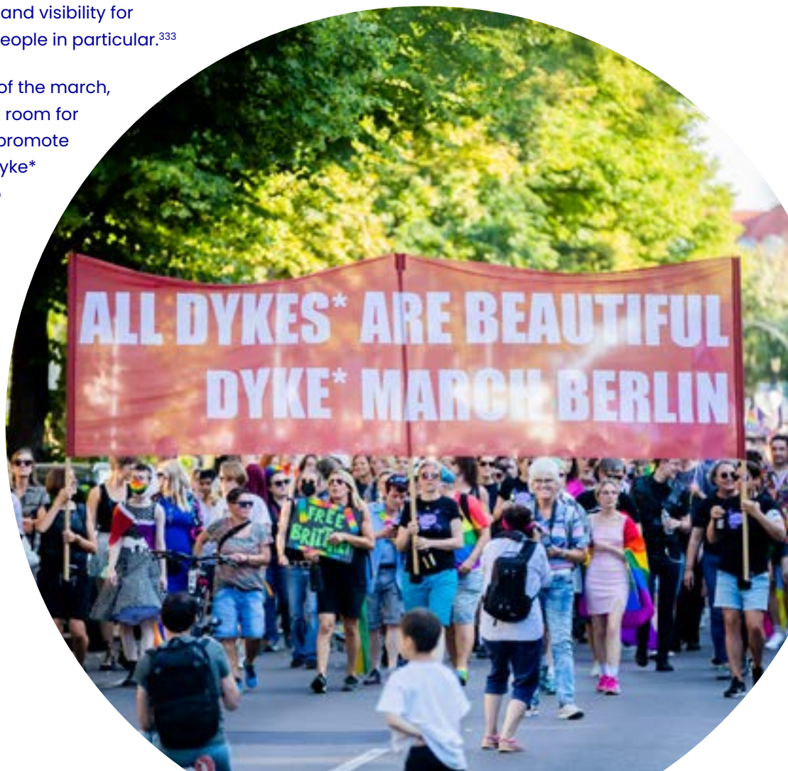
Photo: Dyke* March Berlin, 22 July 2022.