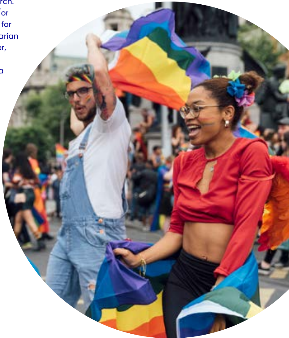
Photo: Friends celebrating Pride together in the streets.

Outright is deeply grateful to the LGBTIQ activists and people interviewed for this report, as well as the respondents to our online surveys. We extend our appreciation to organizers of Pride and other LGBTIQ visibility events worldwide, in different challenging contexts. As always, we stand in solidarity with you in building a world where all LGBTIQ are free, safe and able to be visible.