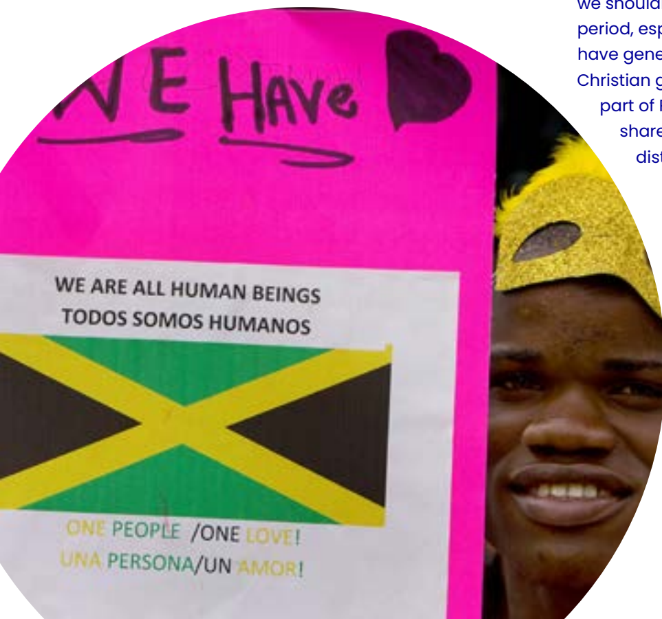
Photo: A Jamaican LGBTIQ activist takes part in the first international march against stigma, discrimination, and homophobia, in Mexico City, on 2 August 2008.

The public reception to Pride, in the face of Jamaica's laws, political history, and religious leanings, is varied. Noting that Jamaicans celebrate Pride on National Independence Day, "there was the pushback to say that we shouldn't have Pride during the Emancipence period, especially when we first started. Now, views have generally mellowed." 260 Still, some conservative Christian groups in Kingston have religious events "as part of Pride. They are usually not violent although they share information about converting souls and they distribute souvenirs like bookmarks yearly." 261