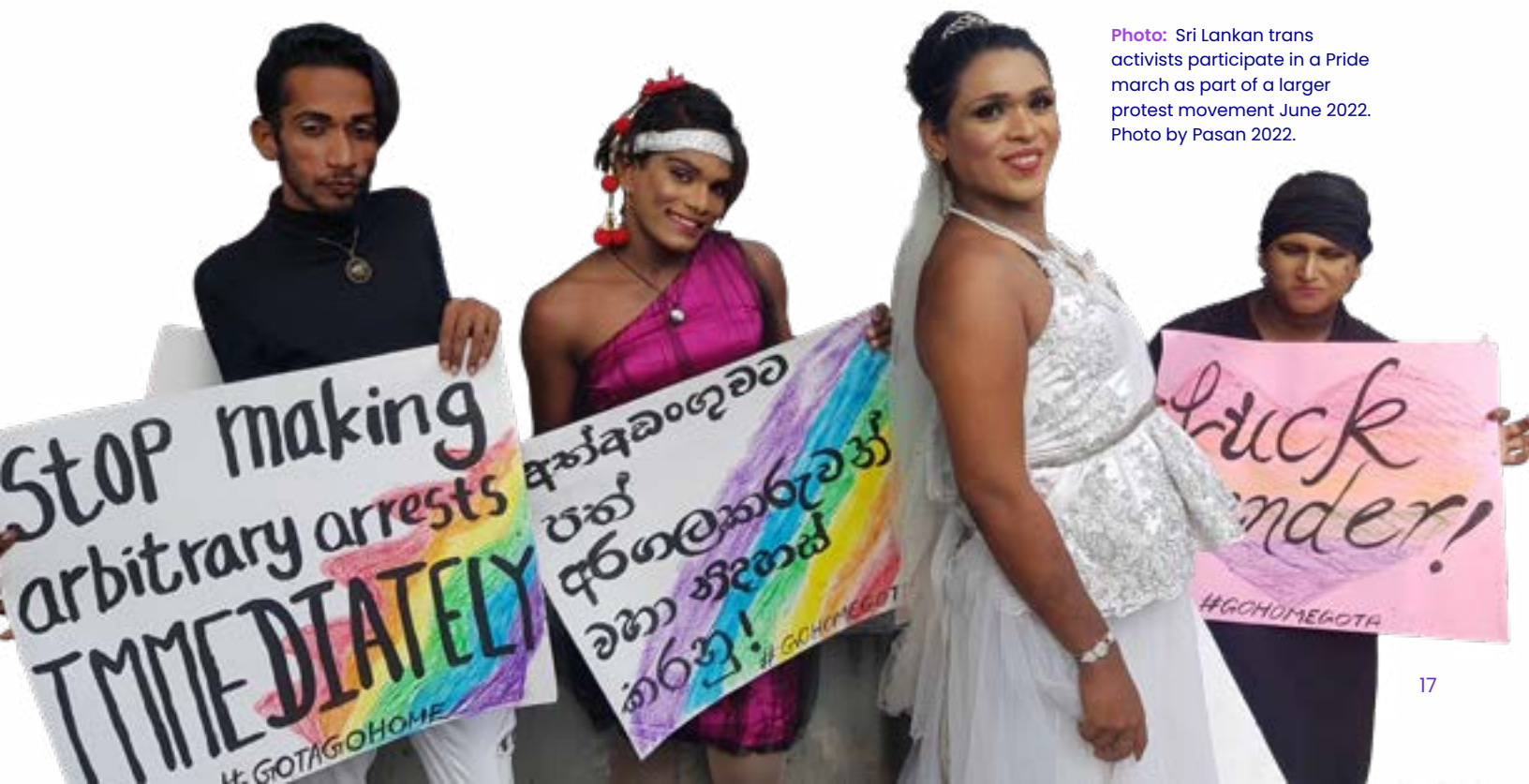
Photo: Sri Lankan trans activists participate in a Pride march as part of a larger protest movement June 2022.

Sri Lanka is a socially conservative state where any form of LGBTQ advocacy faces substantive challenges. Despite being one of the first countries in the non-Western world to achieve universal suffrage in 1931, it is also a deeply volatile state with scars of long-standing ethnonational strife, a 30-year war, unresolved issues of minority rights, and high levels of institutionalized misogyny. In such a context, the LGBTQ community has made significant forward strides despite persistent challenges and backlash from the state, elements of the general public, and religious establishments. It is against this backdrop that the 2022 Pride march and the 2023 Freedom Pride Parade represent historic milestones not only in LGBTQ rights advocacy, but also in the broader sphere of human rights advocacy in general.