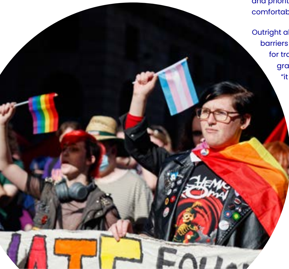
Photo: Brisbane, Australia Pride March, 25 June 2022.

You can’t just go to Pride as an organization, you still have to fight for a platform, you still have to pay for your space there which is why the big corporations and bigger charities are more visible. 314