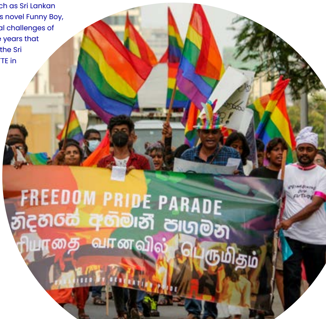
Photo: Pride month in Colombo, Sri Lanka, Sunday, 4 June 2023.

minister. The second insurrection took place in 1988–89 and was also addressed with unprecedented state violence against youth who played an active role in the insurrection. This suppression involved state-run torture chambers and sites where protesters, especially young women, were subjected to sexual violence. The state armed forces have been systematically accused by Tamil rights groups, academics, international