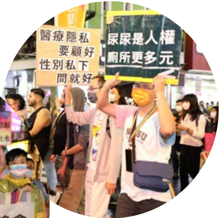
Photo Left & Right: Taiwan Trans March 28 October 2022.