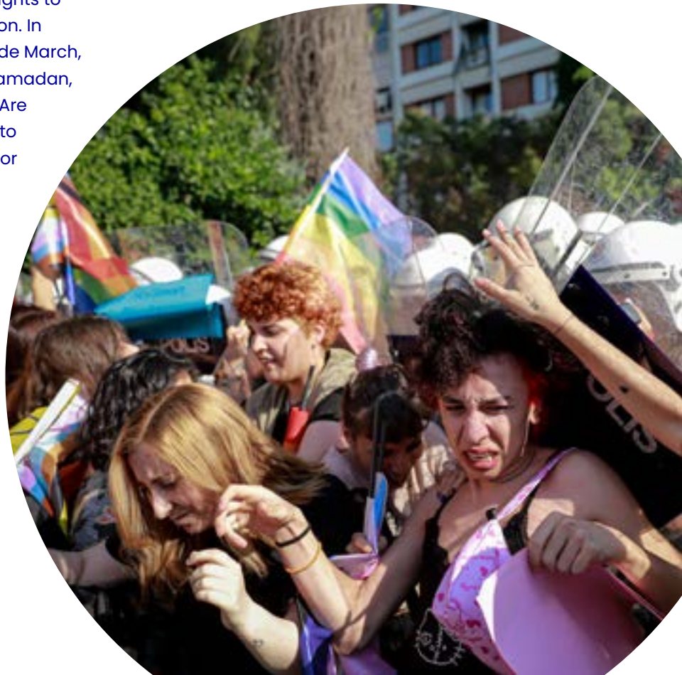
Photo: Clash during the 10th Izmir LGBTI+ Pride March in Izmir, Turkey, 26 June 2022.

In the end, Turgutlu and her team had to find ways to implement their activities “but not openly in public. Just with feminist activists and queer people.” 209