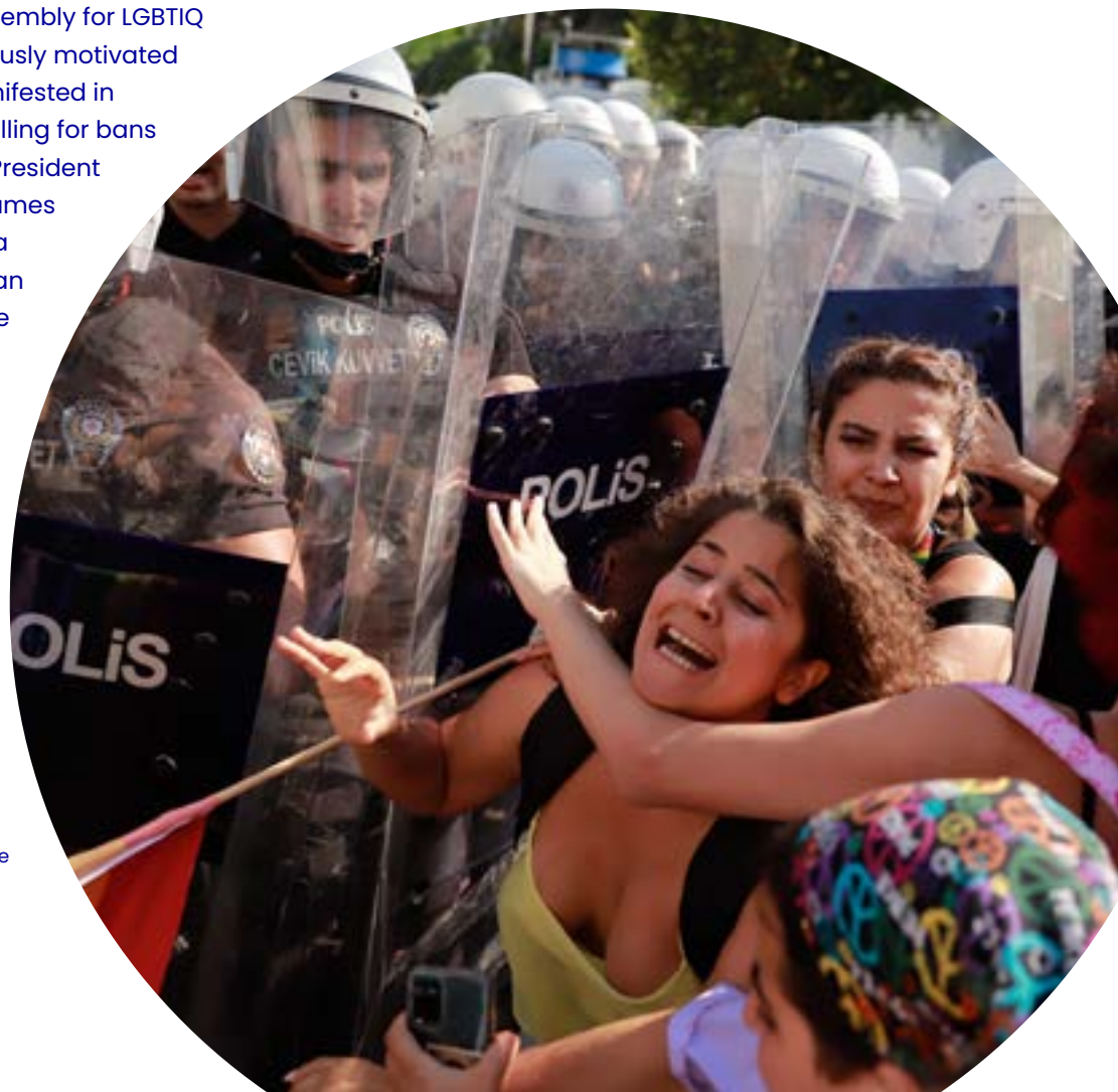
Photo: Clash with riot police officers during the 10th Izmir LGBTIQ+ Pride March in Izmir, Turkey, on Sunday, 26 June 2022.

after which organizers did not attempt a Pride March for another 10 years. 179 The 2003 Pride march in Istanbul saw about 50 people. This number had risen to “hundreds of thousands of people” by 2013. The last marches in Istanbul before Pride became targeted by heavy-handed state crackdowns were a Pride March in 2014 and a Trans Pride March on 22 June 2015. A week after the successful Trans Pride March, however, the police prohibited