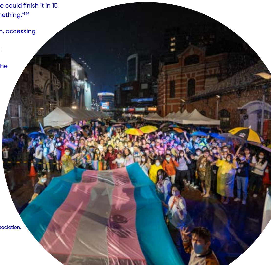
Photo: Taiwan Trans March 28 October 2022

Activists also realized that sponsorships and funding can be attached to limitations, especially in terms of social justice activism. During the first Pride celebrations in 2003, Taipei City government provided some funding for Pride, resulting in criticism from some activists. As a result, "The next year, we decided not to take funding from the government so we could avoid any form of them controlling the course of Pride and our advocacy." 149