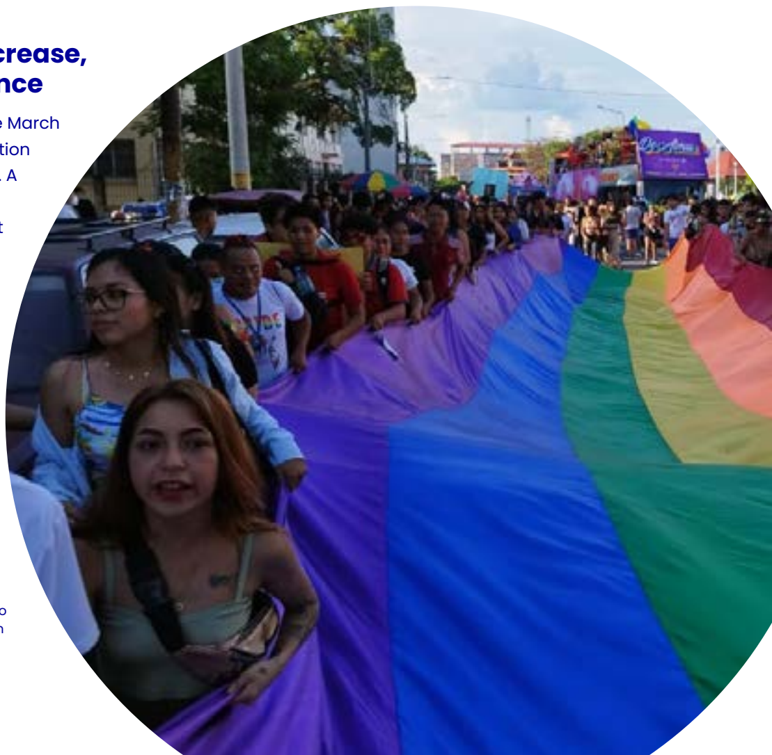
Photo: Iquitos Pride March, 28 June 2022.

I actively participated in this march mainly for the memory of my father. He died before the march took place, the year before. He always told me that he saw the marches in Lima, and asked me why they don’t do their march here, and I told him that someday maybe it will be done here. 100