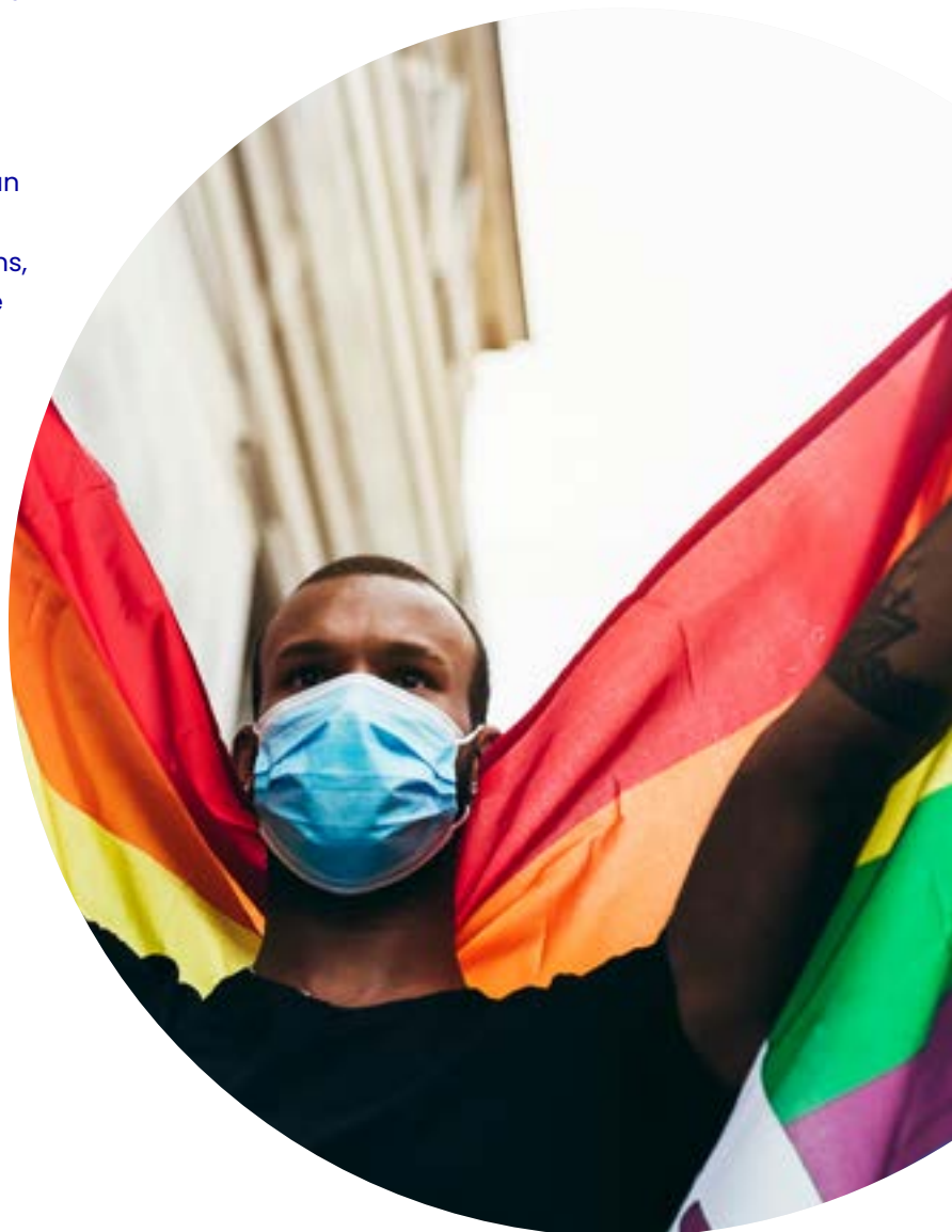
Cover photo: Taiwan Trans March 28 October 2022.

© 2023 Outright International. This work is licensed under the Creative Commons Attribution-Noncommercial- No Derivatives 4.0 International License. To view a copy of this license, visit http://creativecommons.org/licenses/by-nc-nd/4.0/ or send a letter to Creative Commons, PO Box 1866, Mountain View, CA 94042, USA.