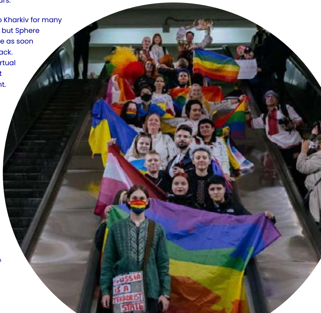
Photo: LGBTIQ activists, undeterred by Russian shelling, enter the Kharkiv subway system for Metro Pride 2022.

In the war with Russia, she added, "It is not only Ukrainians who are fighting for their national identity. It's also the LGBT+ people who are fighting for our identity as well." 75