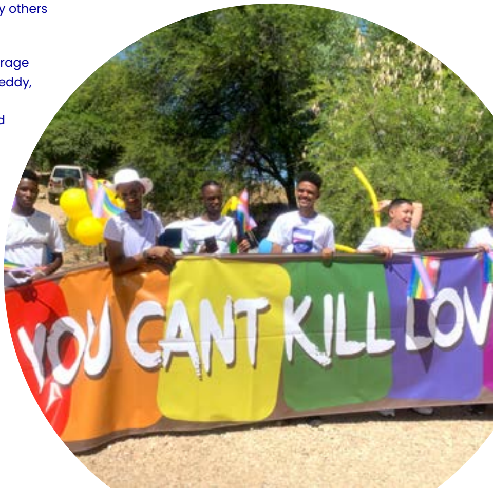
Photo: Pride Parade in Windhoek, Namibia, December 2021.

Funding also plays a major role in terms of inclusion. Ensuring participation of LGBTIQ people across the country for Pride events is extremely difficult. It is difficult to mobilize everyone to showcase the sheer massive number of LGBTIQ people in Namibia, for example. Not everyone can show up. I don’t see a lot of faces during our Pride events because of financial constraints. This is also one of the key factors that makes or breaks Pride events. When you march with only seven, twenty, or fifty people, people assume that