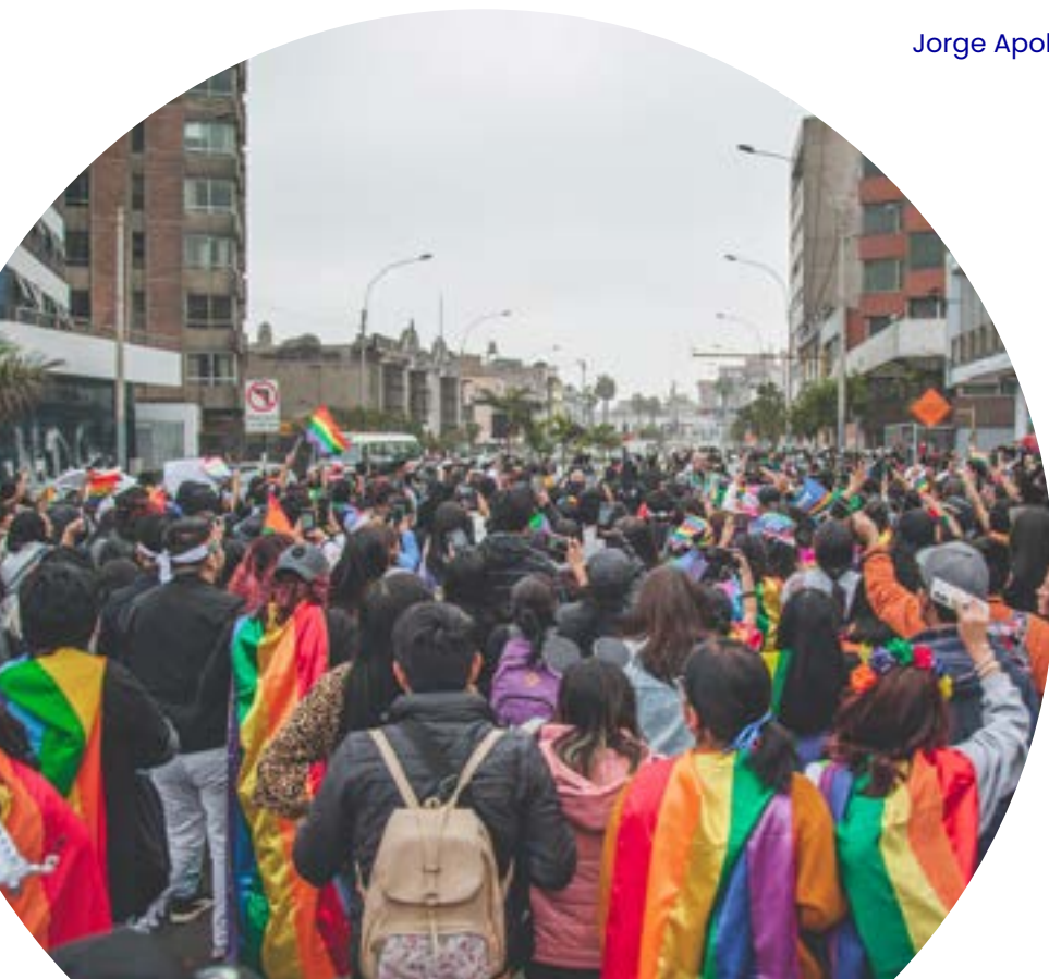
Photo: Lima Pride March, 25 June 2022.