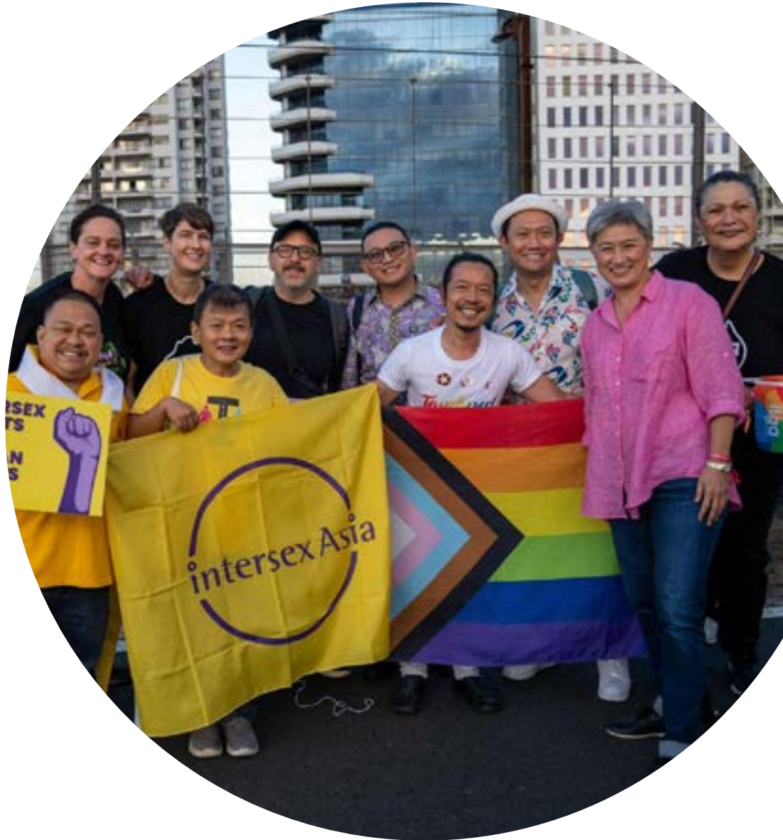
Photo: Intersex rights activists at Sydney WorldPride 2023, in March 2023.

people but will be limited by funds available.” 294 In as much as accessing funding is difficult, Champion for Change, in Nepal, is very careful about raising money for Pride because “it is our day to show visibility and celebrate who we are. We don’t want sponsors that will dictate what we should do and take away the essence of Pride.” 295