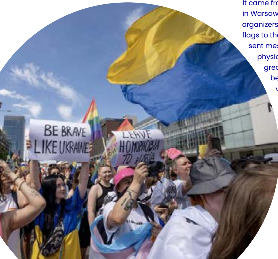
Photo: Marchers at Kyiv-Warsaw Pride 2022 show solidarity with Ukraine in the face of Russia's invasion.