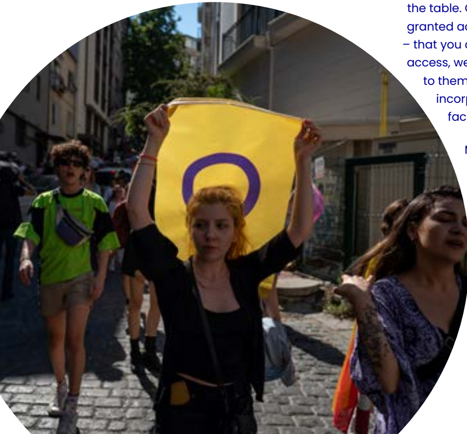
Photo: LGBTQ Pride March in Istanbul, Turkey, Sunday, June 26, 2022.

Many intersex people and rights activists express that they cannot attend Pride due to limited funding. 292 According to Hiker Chiu, "Pride is too expensive for us and it is not possible to self-fund." 293 To address this, Chukwuike said, "I feel that there should be an increase in funding for Prides so that you can incorporate more people. Pride organizers may want to incorporate more