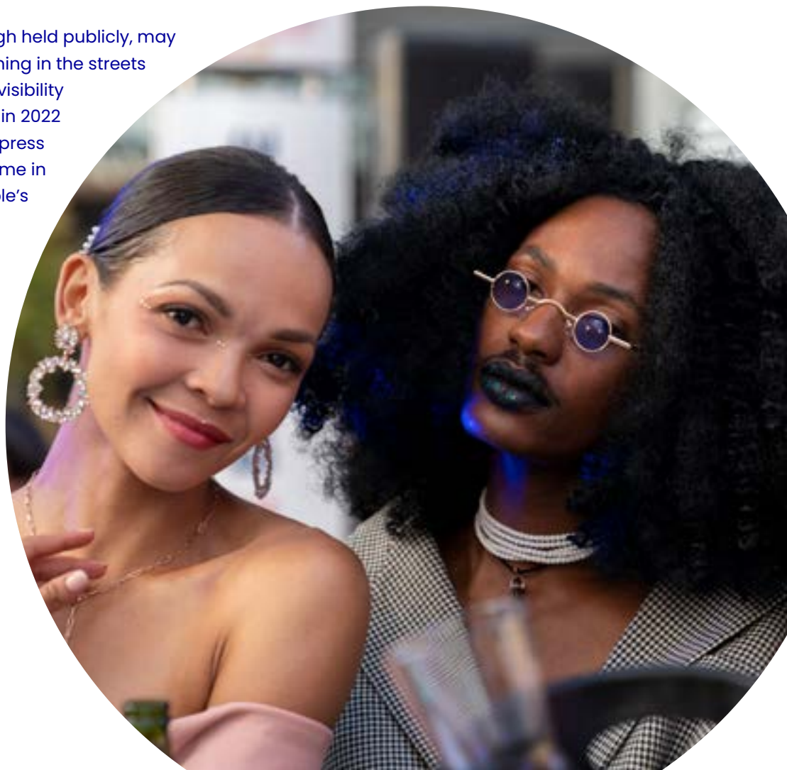
Photo: Drag Night Namibia “Rain-Ball”, Windhoek, December 2022.

All over the world, creating safe spaces for people marginalized by mainstream societal standards is a human rights priority. Many LGBTIQ people Outright