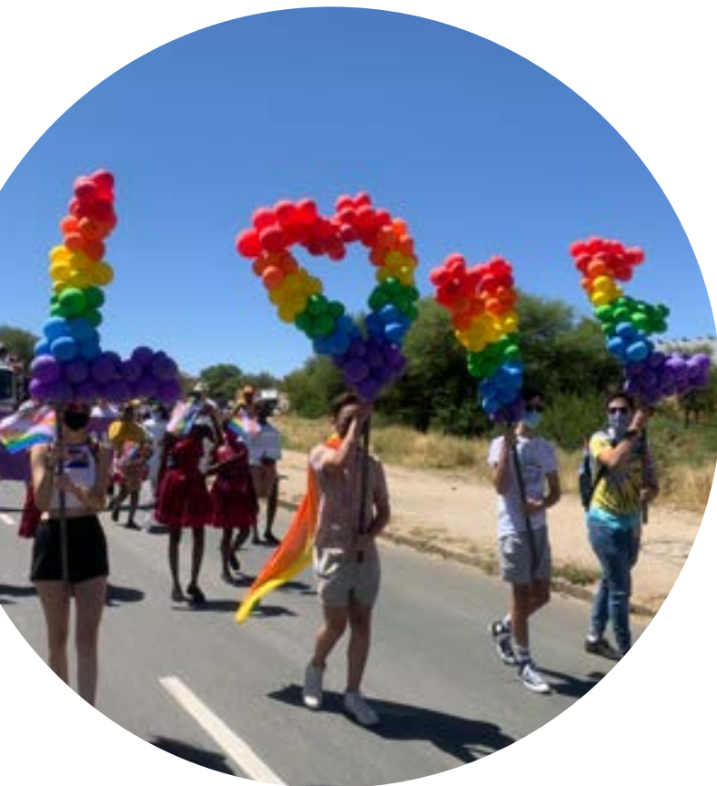
Photo: Pride Parade in Windhoek, Namibia, December 2021.

Pride activities included a march, a queer art exhibition in partnership with a feminist organization, comedy show, drag night, a roadshow involving a dance group to promote destigmatization of HIV/AIDS during the Worlds Aids Day campaign, a book reading by American nonbinary writer and performer Alok Vaid-Menon, and a theatre performance and workshop discussing the state