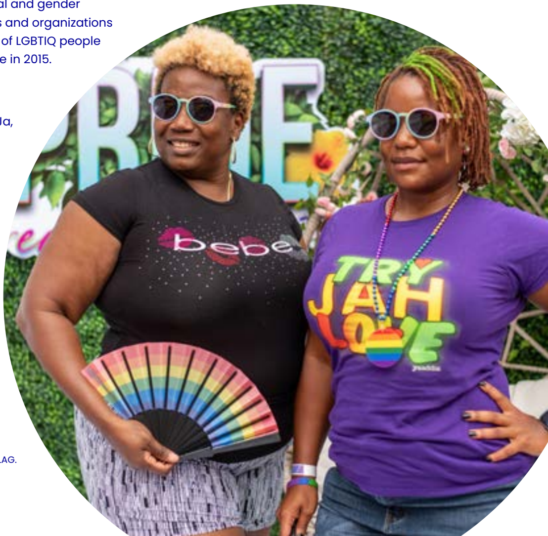
Photo: Participants at the Pride Breakfast in Kingston, Jamaica, August 2022.