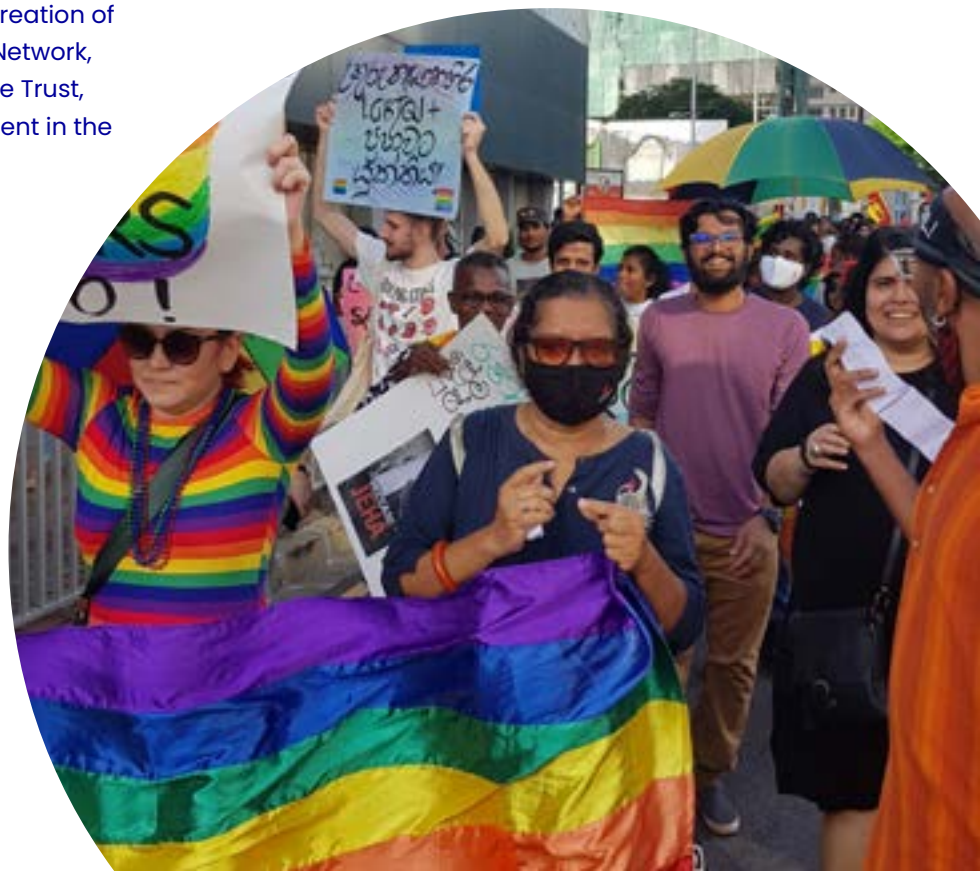
Photo: Sri Lankans march in the first public LGBTIQ march during Pride Month, June 2022.

In early 2023, a member of the country's unicameral parliament presented a private member's bill calling for the repeal of British laws that criminalize same-sex relations. 37 In May 2023, the Supreme Court of Sri Lanka cleared the path for this bill to proceed, issuing a ruling that the bill was not inconsistent with the Constitution of Sri Lanka. 38 Nonetheless, this bill has been the subject of controversy and has not garnered sufficient support within Parliament, causing activists who have been carrying out efforts to achieve holistic queer liberation to express skepticism. 39 Sri Lanka remains a deeply homophobic and transphobic country, with severe