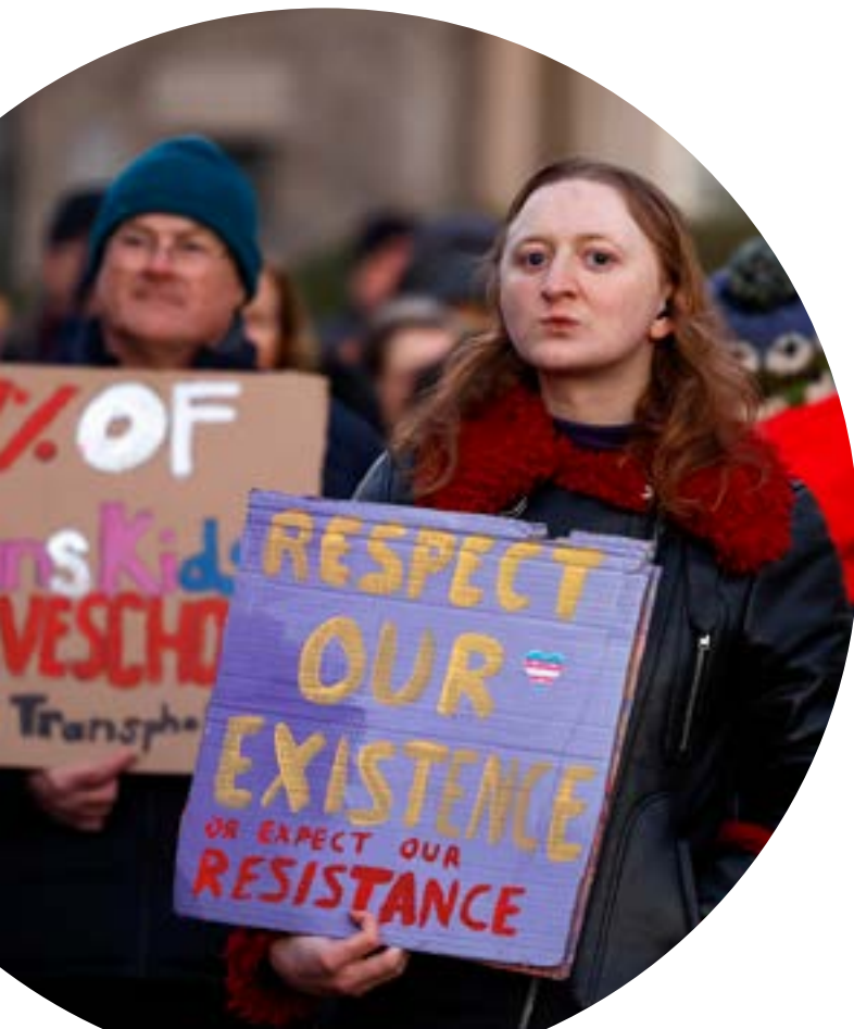
Photo: Trans rights activists at Portobello Library on 14 March 2023, in Edinburgh, Scotland.