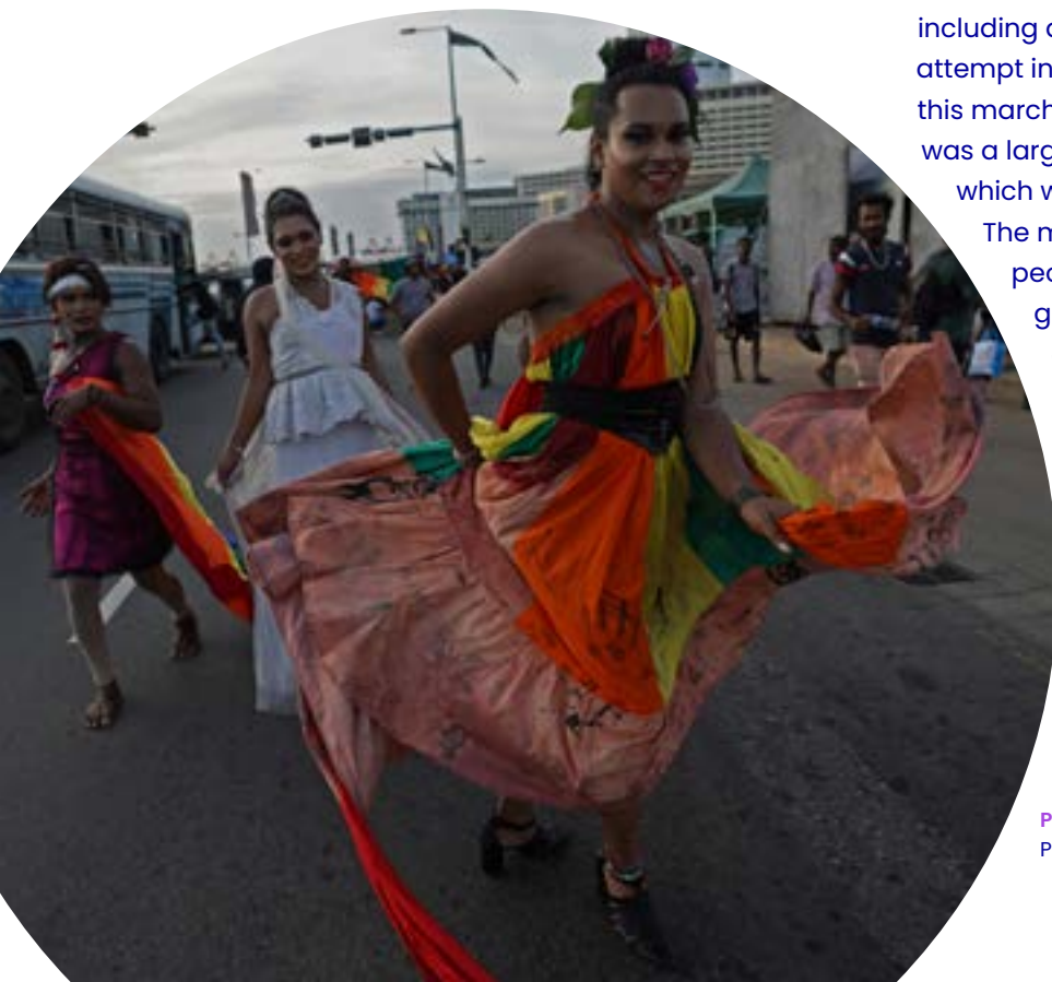
Photo: Pride parade in Colombo on 25 June 2022.

One key factor that defines Sri Lanka's Pride parade is its departure from what some activists describe as the non-profit industrial complex. In Sri Lanka, just as in many other Global South countries with anti-LGBTQ laws and practices, LGBTQ rights advocacy takes place within the non-profit sector and is almost exclusively