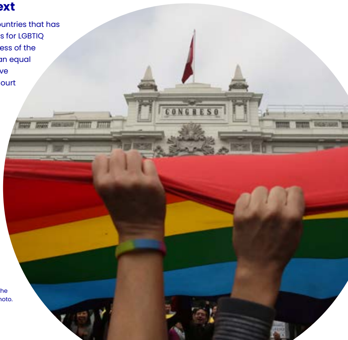
Photo: Sit-in by LGBTIQ groups in front of the Peruvian Congress in June 2019, days before the Lima Pride March.

Peru's lack of institutional commitment to LGBTIQ equality is reflected by two recent landmark judgments against it at the Inter-American Court of Human Rights. Both cases reached the Inter-American Human Rights system after plaintiffs were unable to obtain justice in national courts.