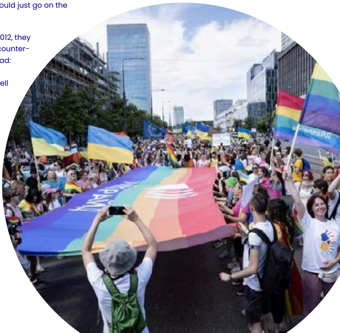
Photo: Marchers at Kyiv–Warsaw Pride 2022 show solidarity with Ukraine in the face of Russia’s invasion.

A number of high-profile guests came from the EU to participate the following year, forcing the police to take steps to protect the march. The police cordoned