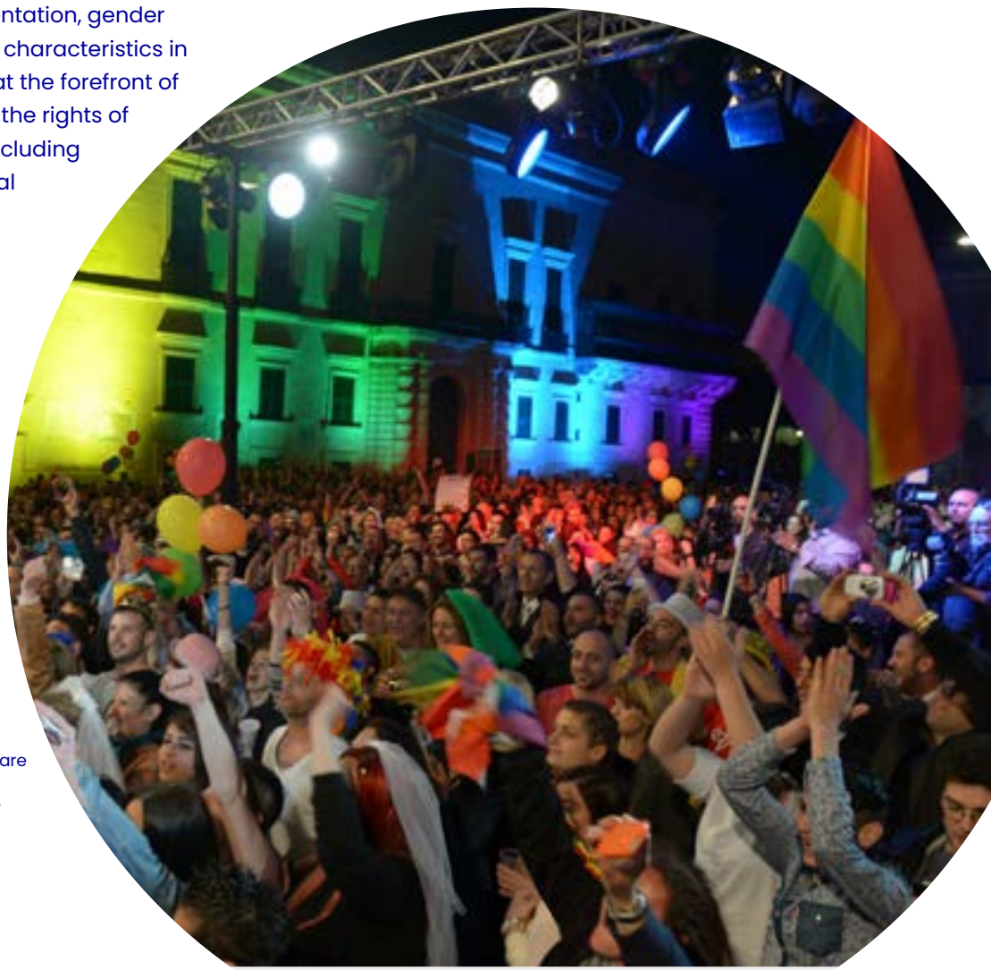
Photo: People celebrate in Saint George's Square after the Maltese parliament approved a civil unions bill in Valletta on 14 April 2014.

Movement (MGRM) – now Malta LGBTIQ Rights Movement – started the conversation and work on LGBTIQ rights advancement, with limited resources, in the early 2000s and held Malta’s first Pride in the capital city, Valletta, in 2004. 221 About 50 participants attended, “most of whom were straight allies and some politicians who supported equality.” 222 At the time, “there was mostly backlash and ridicule. But Pride continued year after year, with