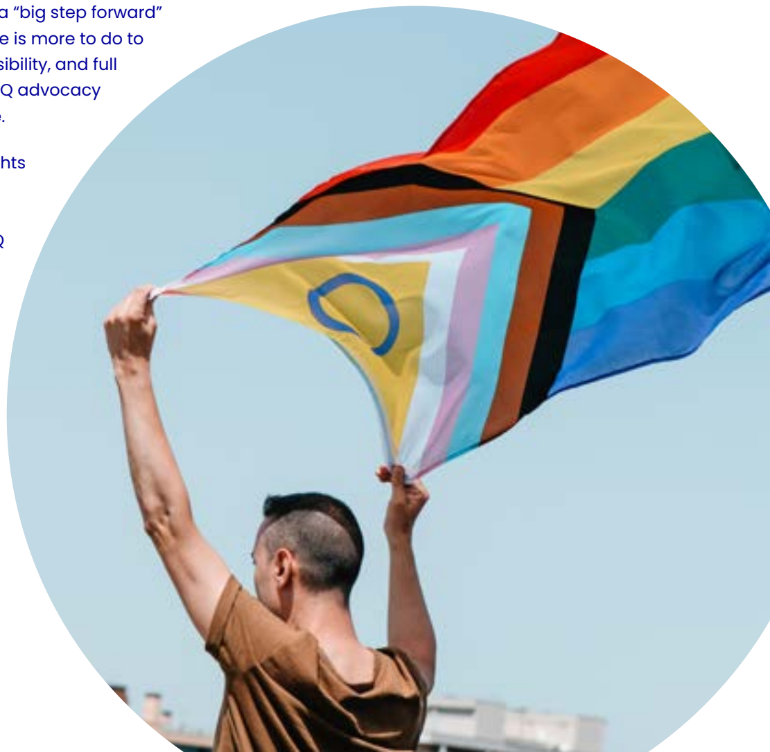
Photo: A person waves an intersex-inclusive Pride flag.