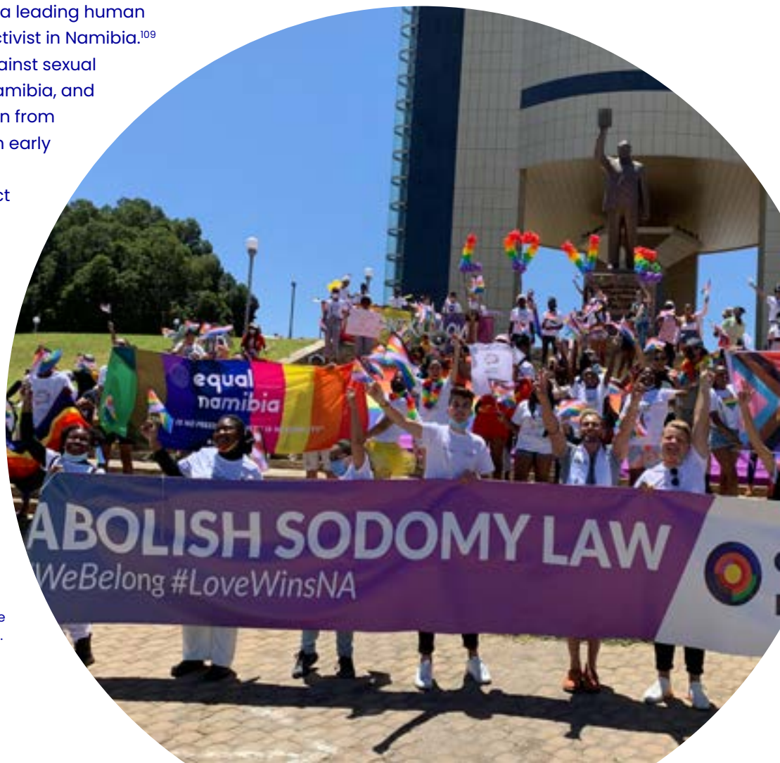
Photo: LGBTIQ people and activists at the Pride Parade in Windhoek, Namibia, December 2021.

In 2021, with Pride as an entry point, South African activists joined the Namibia Equal Rights Movement to meet with the Namibian Law Reform Commission at the