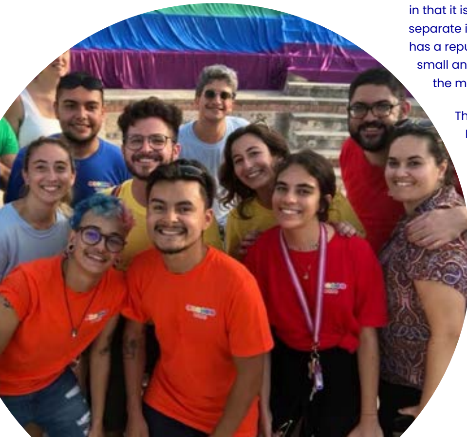
Photo: Participants at the first Pride March in Gozo, Malta.

The organization that championed the first ever Pride on the island, LGBTI+ Gozo, was founded in 2015 to offer a safe space for young LGBTIQ people who remain in Gozo and cannot go to the island of Malta as they please. 236 The organization’s activities began with workshops, with the goal of eventually conducting a public Pride march. As on the mainland, the Maltese government has been supportive, supplying an office for