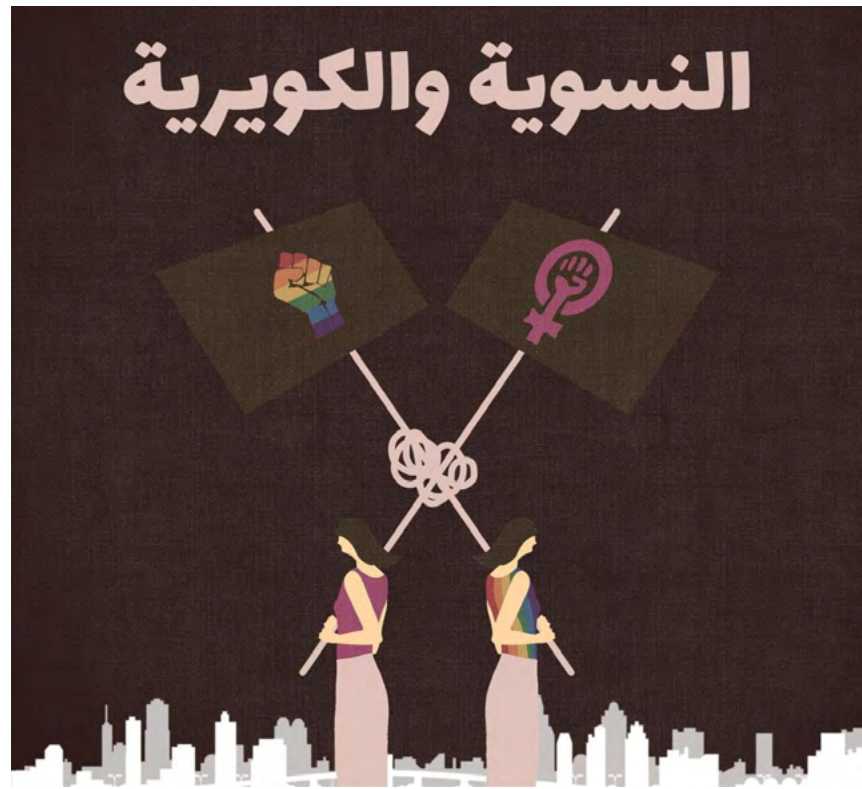
"Feminism and Queerness." Illustration by GALA

they are prioritized. They are not prioritized at all." 81