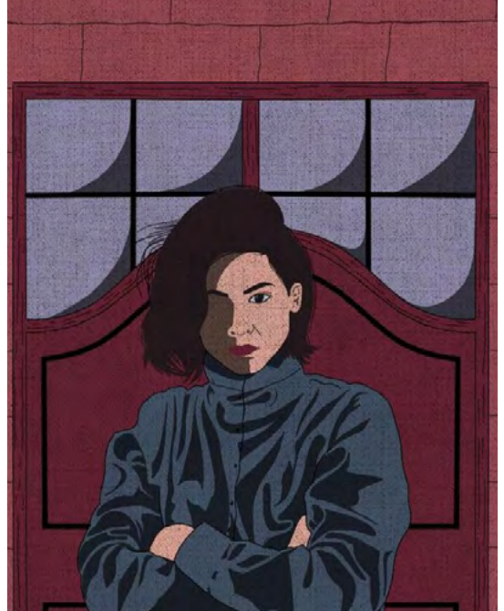
Illustration by GALA