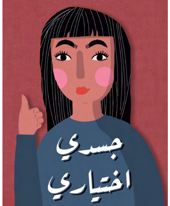
Illustration by GALA