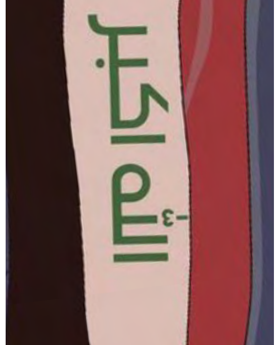
Illustration by GALA