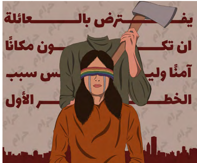
"Family is supposed to be a safe place, not the first source of danger." Illustration by GALA

Further, it has yet to ratify the Optional Protocol to CEDAW, which enables individuals from the country to file complaints for assessment with the Committee on the Elimination of Discrimination against Women. 10 Many Iraqi laws still do not comply with CEDAW. 11