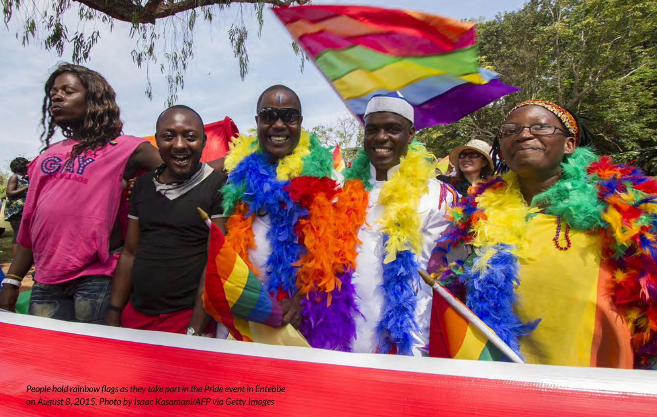
People hold rainbow flags as they take part in the Pride event in Entebbe on August 8, 2015.

This is the simple fact of life for LGBTIQ people and their families and allies in Uganda. Ugandan society is socially conservative, and anti-LGBTIQ sentiment is further fueled by some Christian churches, which take a hard anti-LGBTIQ line. Historically, this view has been promoted and even funded by fundamentalist churches in the USA, which have sent missions to Uganda. 84