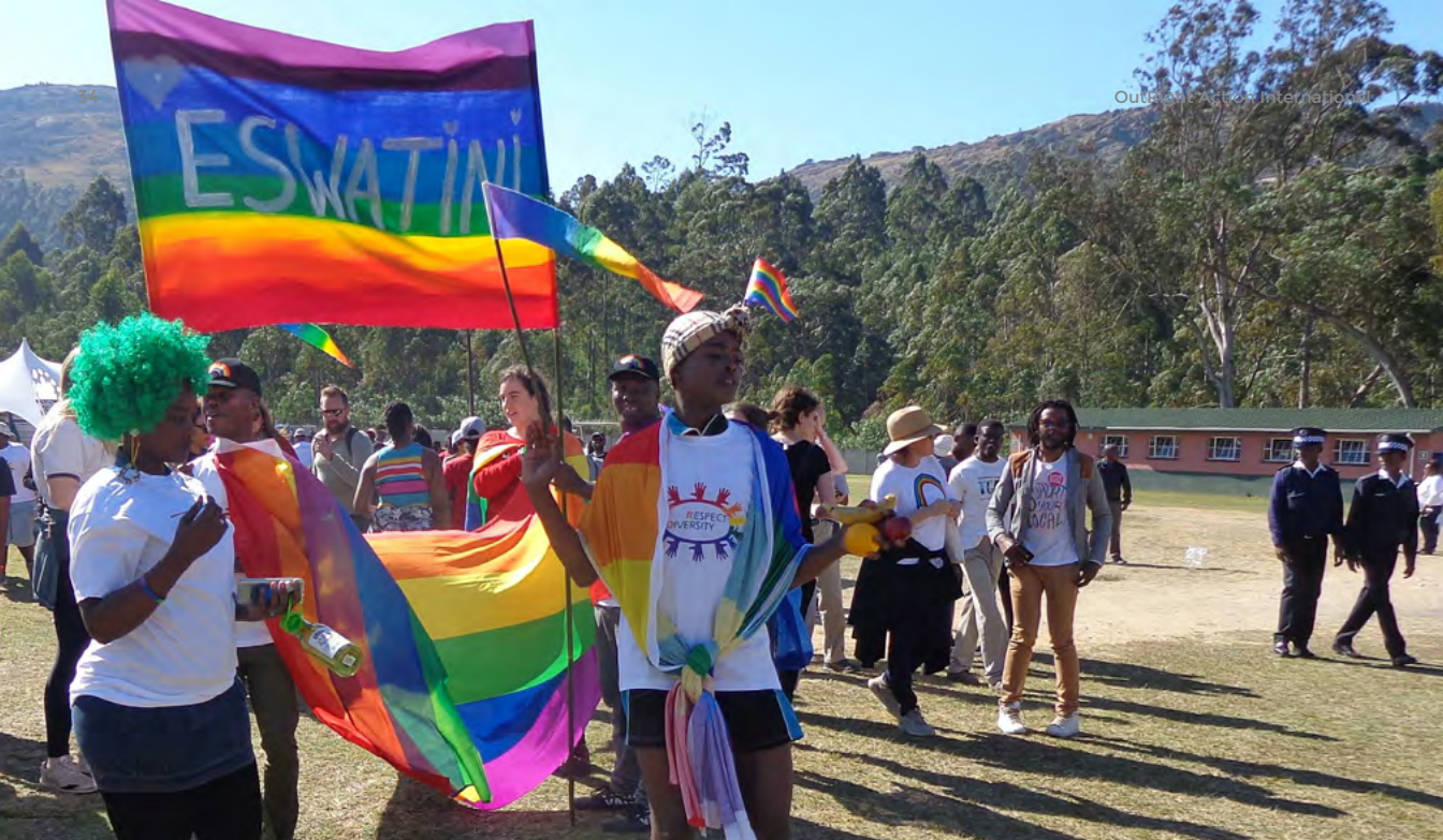
People take part in Eswatini's (formerly known as Swaziland) first Pride in Mbabane on June 30, 2018.