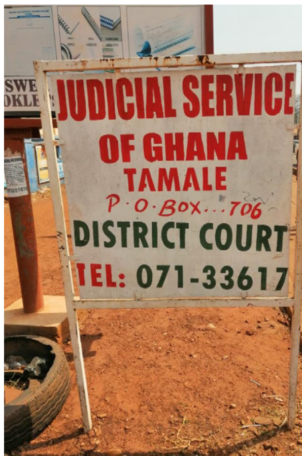
Signboard of Tamale District Court.